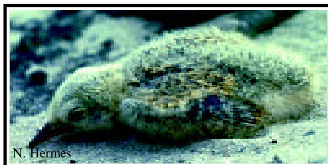
Little Tern - juvenile

A recovery plan is being prepared for the Little Tern.