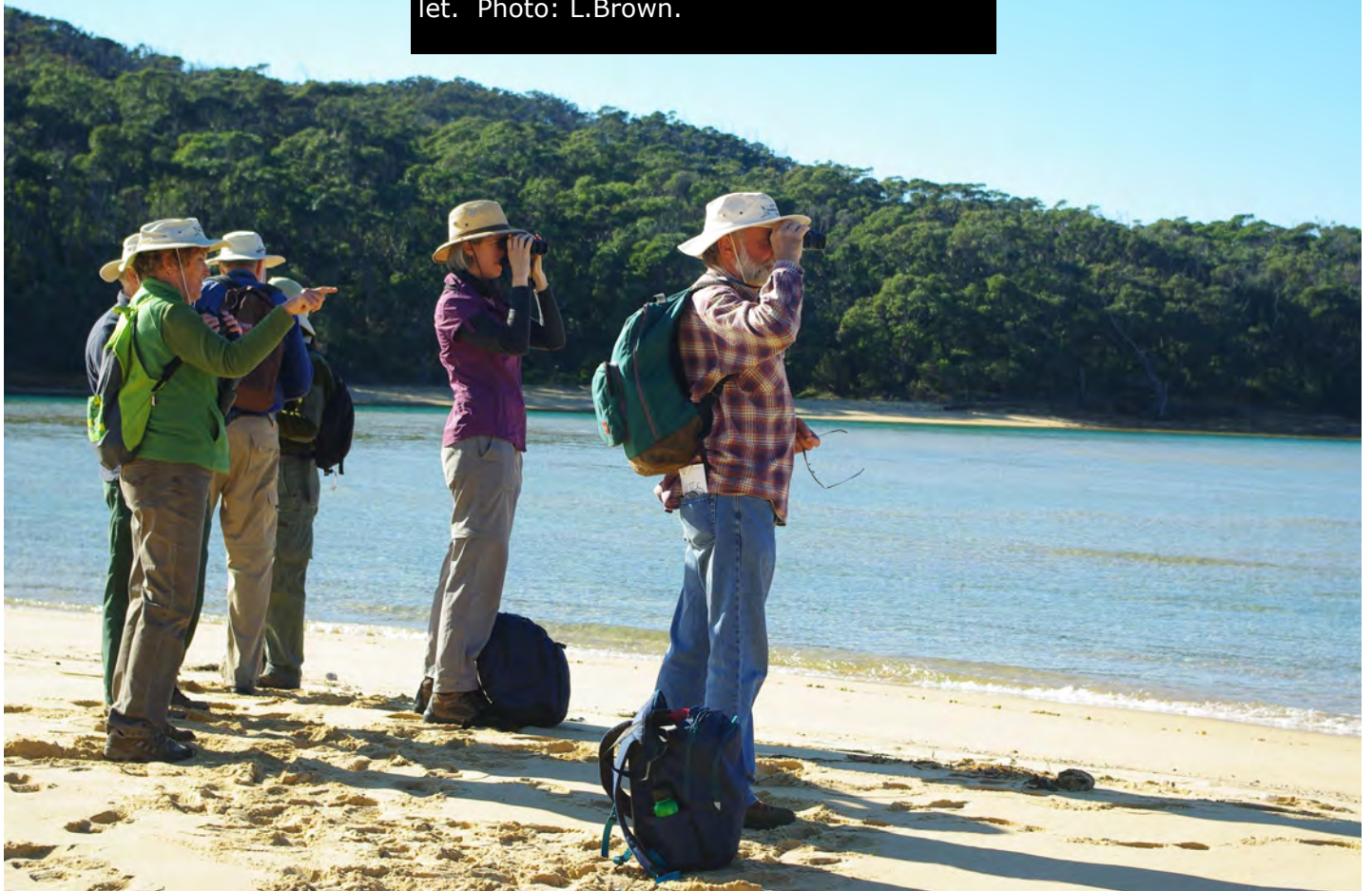
Below: Shorebird Survey team at Bithry In-let.