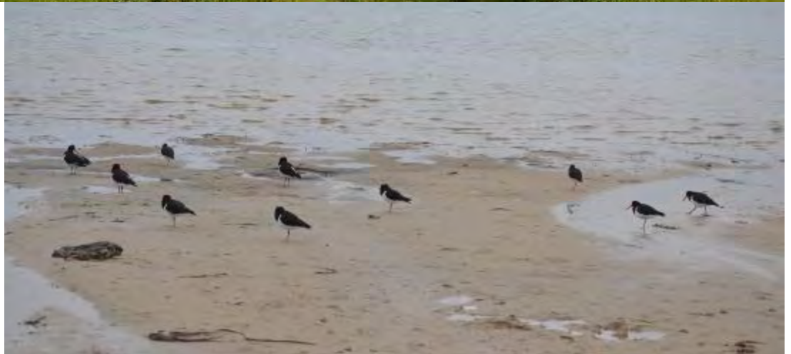
Right: Pied Oyster-catcher gathering at Wagonga Inlet.

Thanks for helping with the Far South Coast NPWS Threatened Shorebird Recovery Program