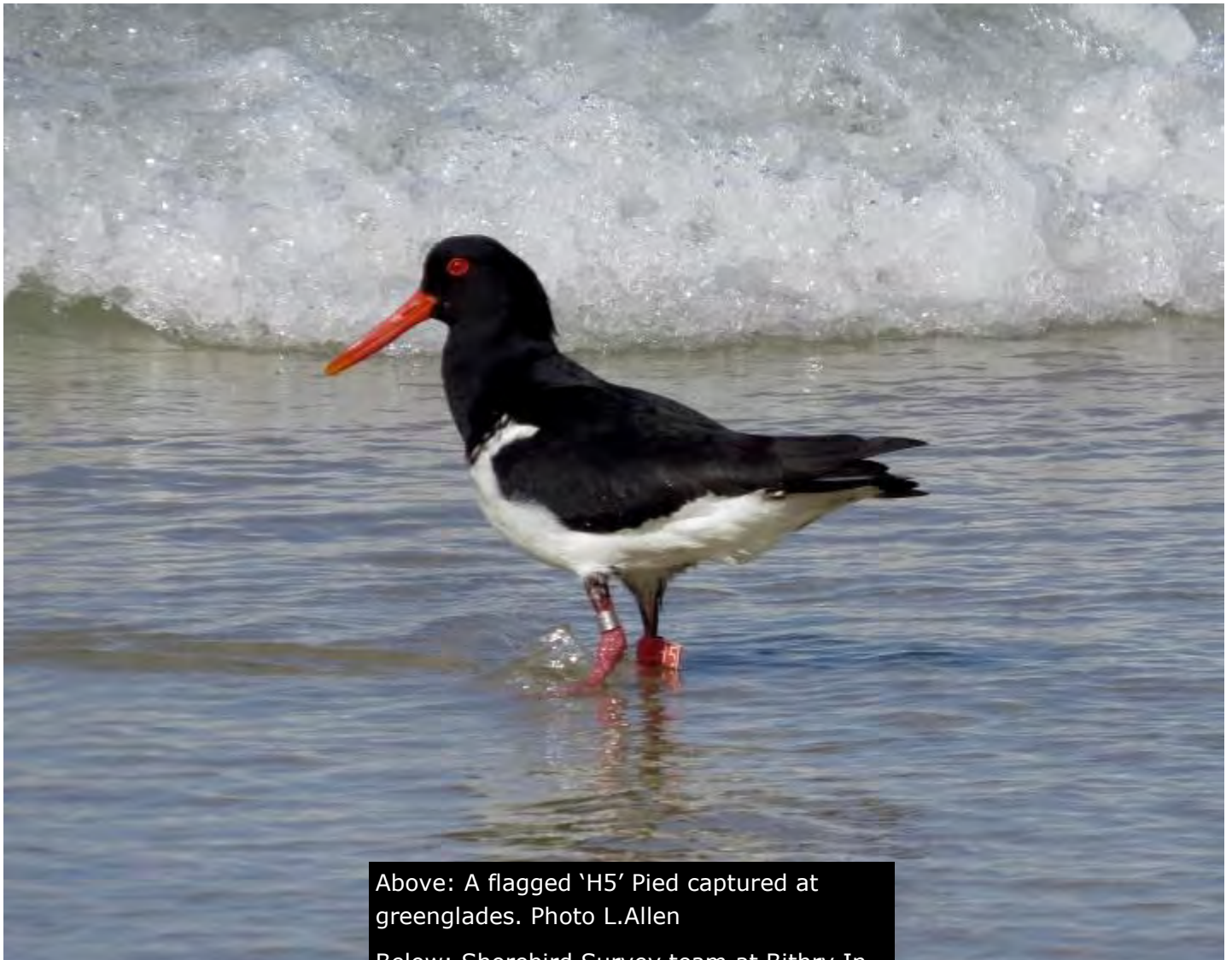
Above: A flagged 'H5' Pied captured at greenlades.