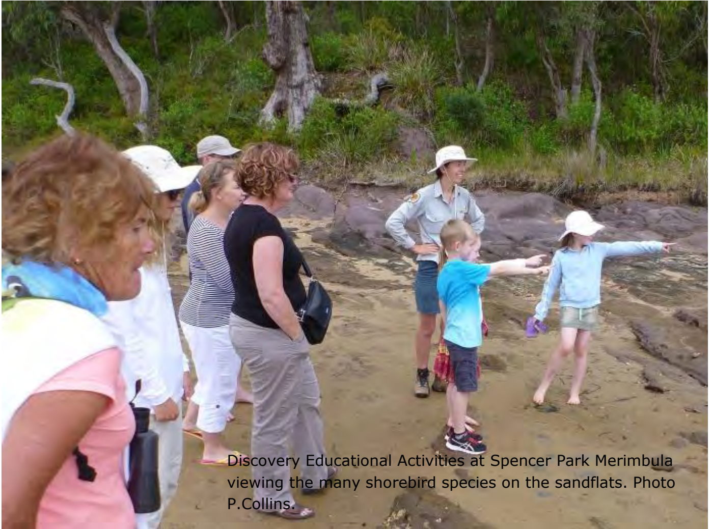
Discovery Educational Activities at Spencer Park Merimbula viewing the many shorebird species on the sandflats.