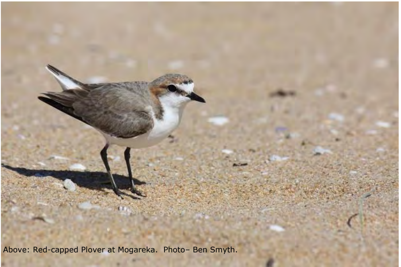
Above: Red-capped Plover at Mogareka.