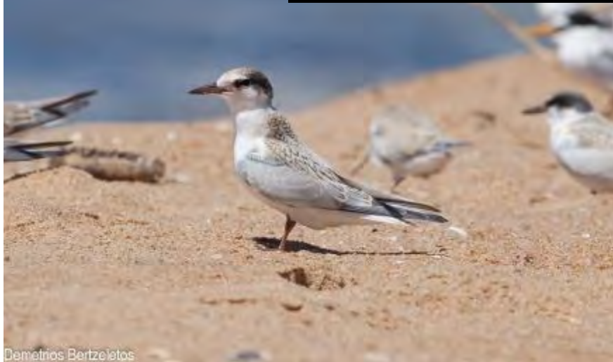
Above: Little Terns (NB and Breeding) along with fledglings on the shoreline at Moga-reka. Below: Fairy tern adult and chicks.