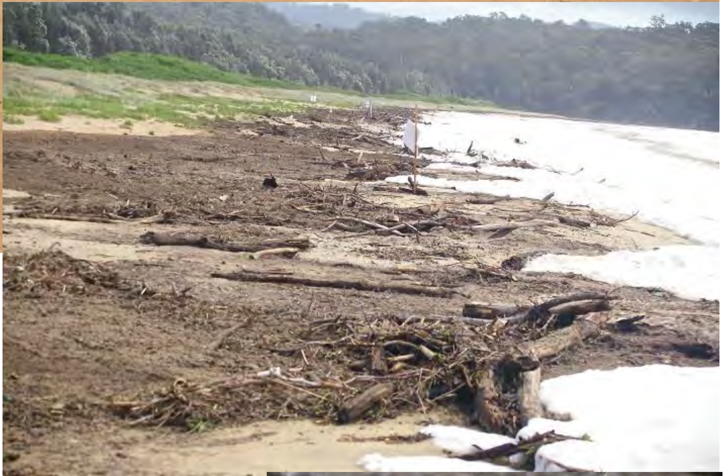
Top: Signage works effectively at Mogareka.