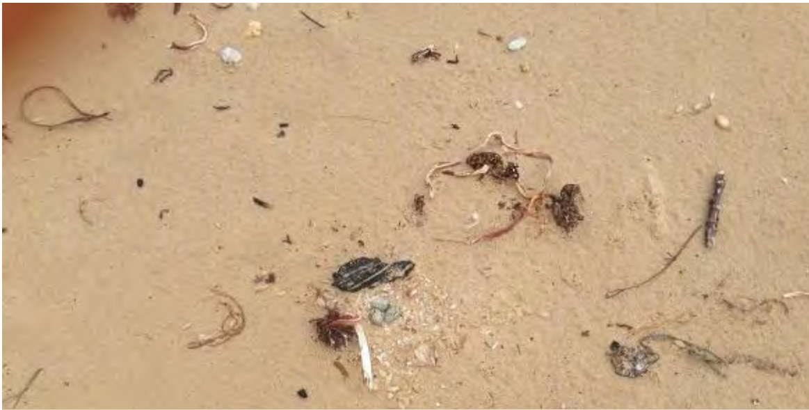
Left: a decorated Hooded Plover nest.