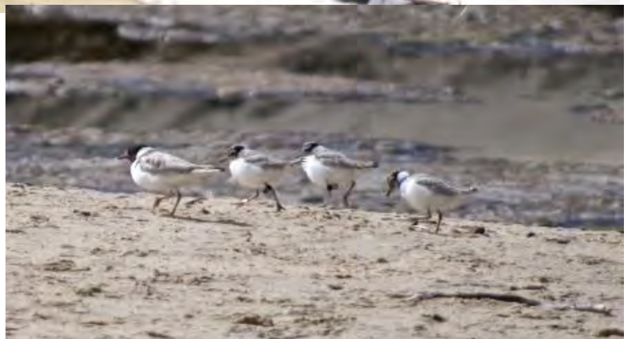
Bottom: the resident Hoodie Family at Nullica—adult with 3 chicks.