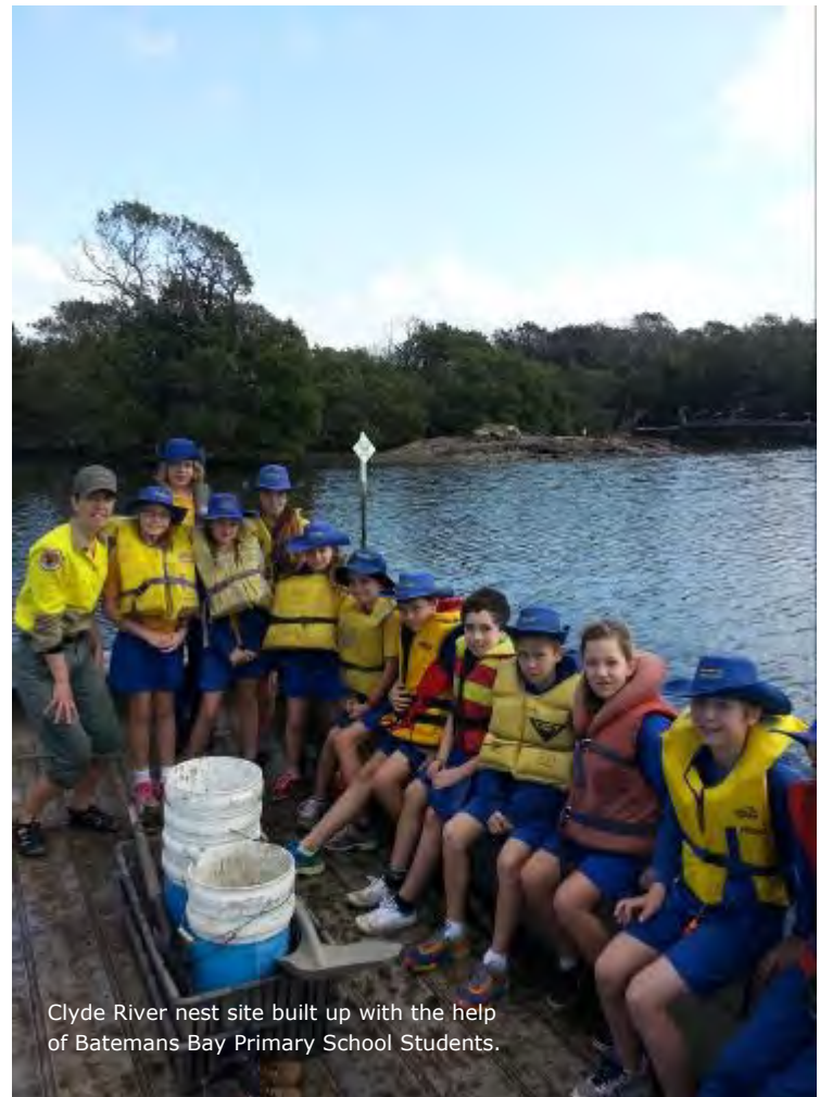
Clyde River nest site built up with the help of Batemans Bay Primary School Students.

The 2014-2015 shorebird breeding season on the Far South Coast was interesting to say the least. We experienced extreme flood events in December, beaches eroded away and others covered with timber and debris—which did not stop one determined pair of Hooded Plover breeding. We undertook Biennial Hooded Plover surveys, participated in the Mimosa Rocks Bioblitz, coordinated Discovery educational activities, and even got out there over winter to survey many beaches and estuaries on foot, boat and kayak! We promoted the program at festivals, in the media, through many posters put out around the region and just from having a chat to beachgoers. As always all of this could not have occurred without the help of all of our NPWS Shorebird Volunteers.